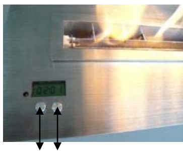
tank opening 2 1 on/off switch