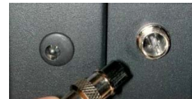
dry contact for home automation