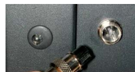
dry contact for home automation