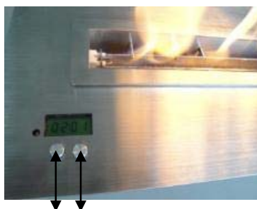
tank opening 2 1 on/off switch